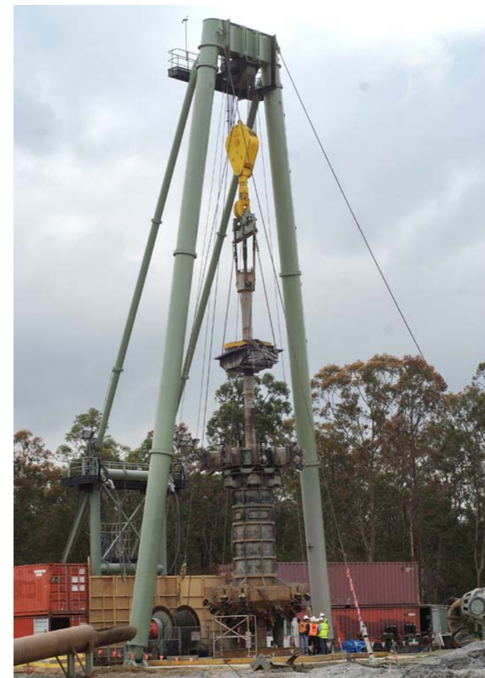
Rig 100 at Austar Coal Mine

Abergeldie owns and operates three large blind bore drilling rigs in Australia: up to 50% larger than any others in the world.