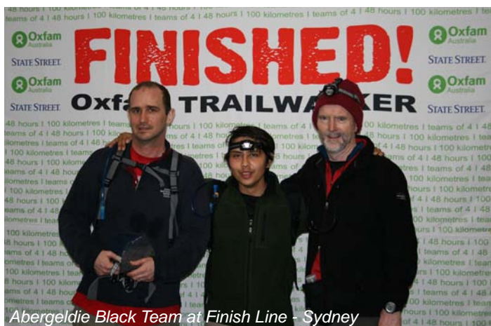
Abergeldie Black Team at Finish Line - Sydney

From all of the walkers, heartfelt (and foot-felt) thanks to those who helped to make these annual events so successful through their physical, moral and financial support.