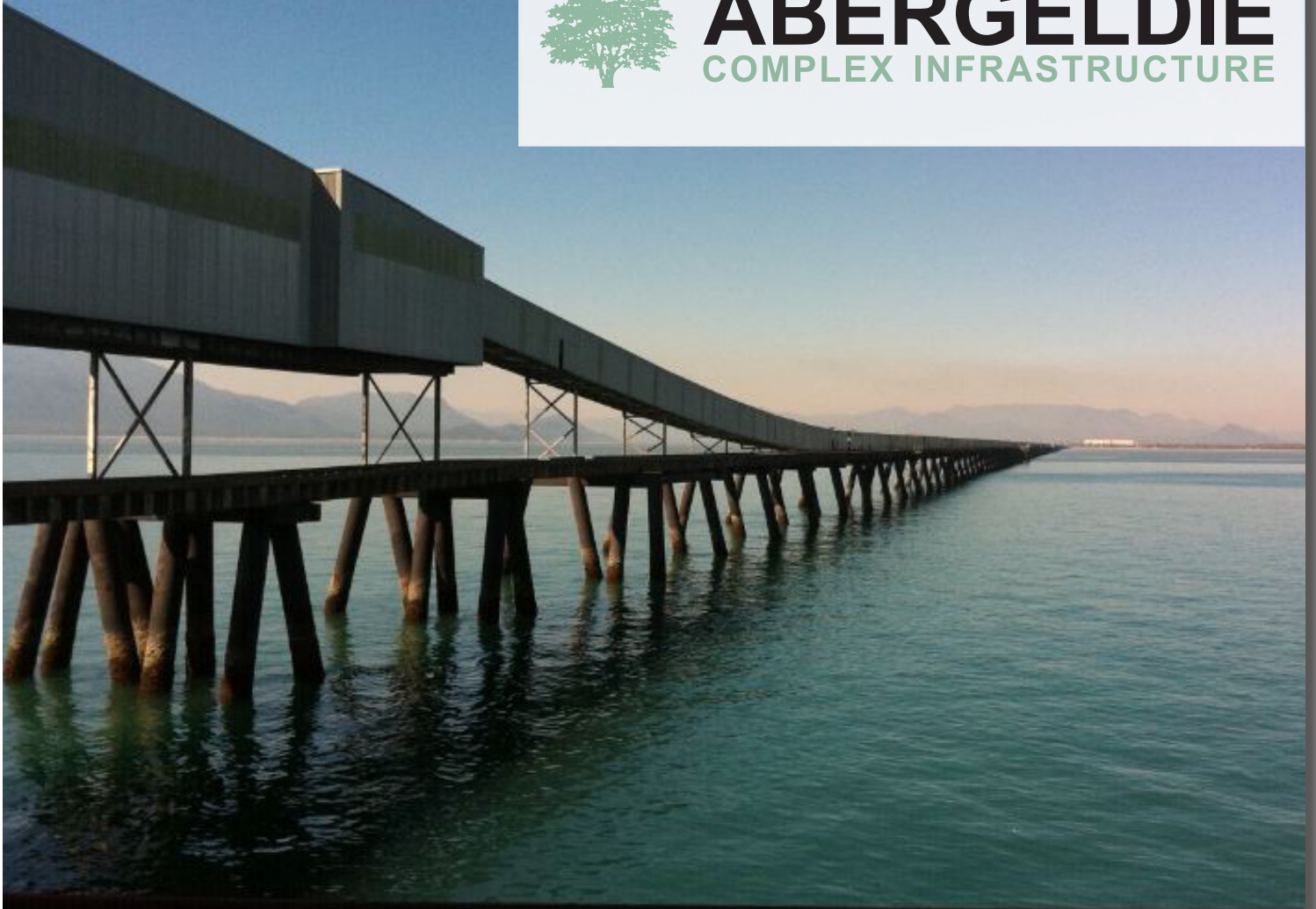
Lucinda Bulk Sugar Terminal - Cyclone Yasi Repair Works