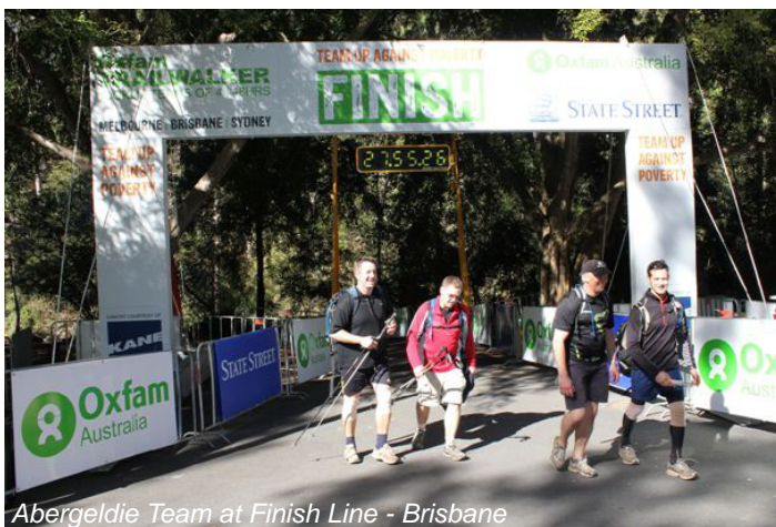
Abergeldie Team at Finish Line - Brisbane